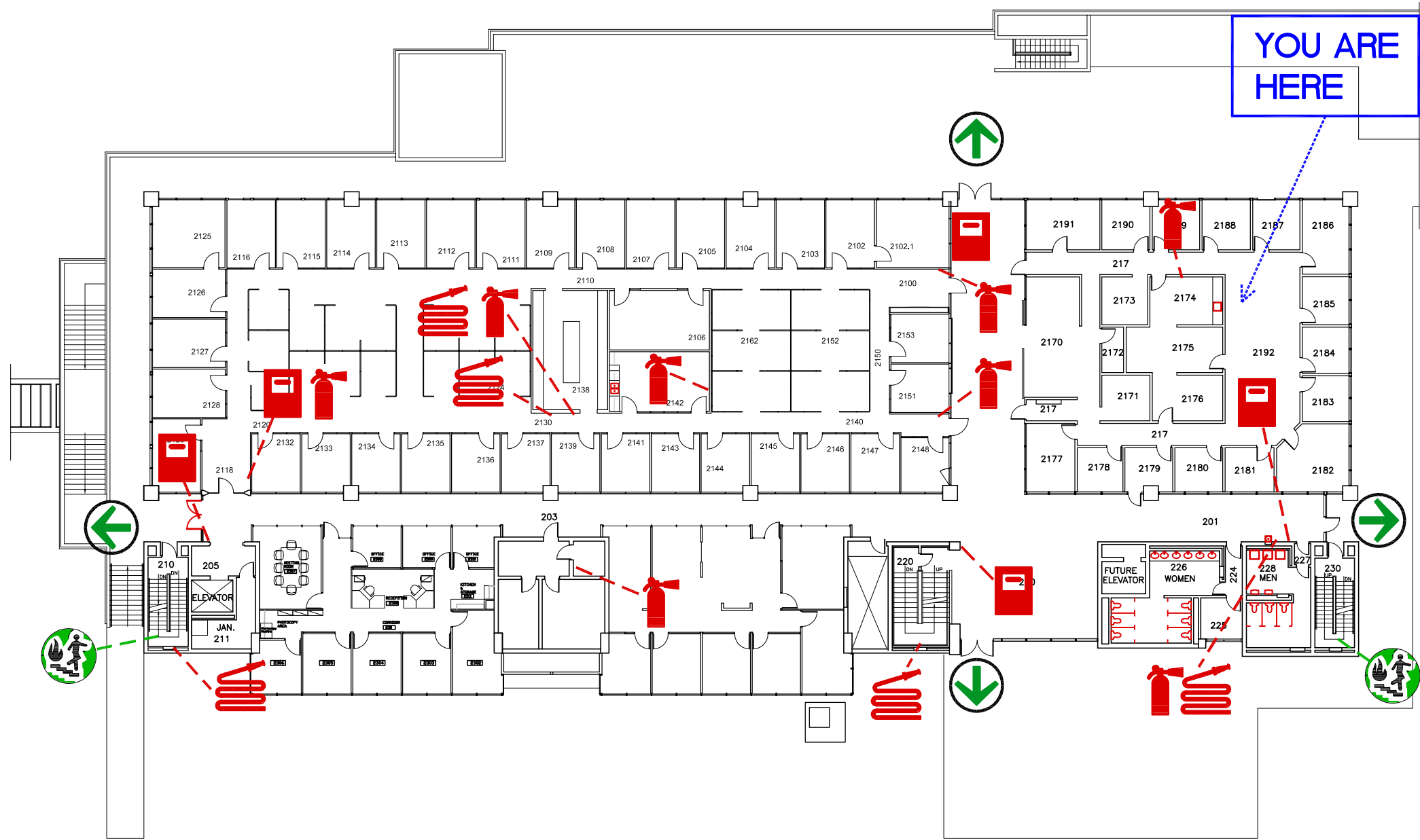
SECOND FLOOR PLAN(EAST) LEVEL 13 SCALE : NTS